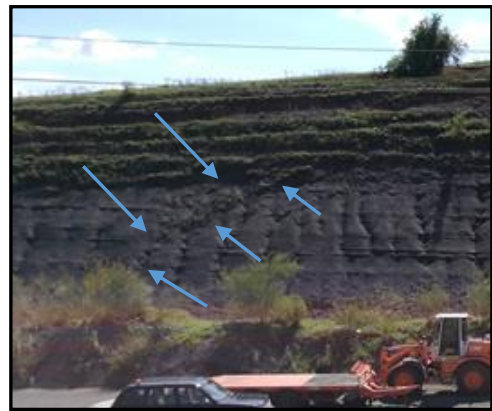
Figure 2: Fault in eastern side of road cutting, Picton Rd near the Nepean River.